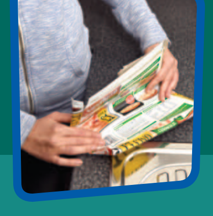
3 Flatten your cardboard and plastic bottles