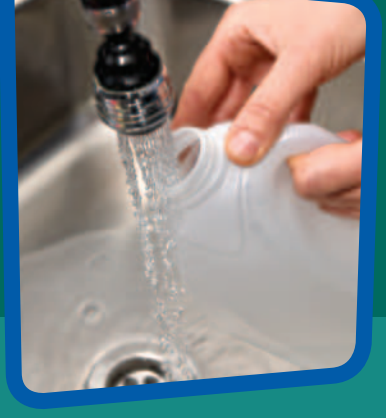
Rinse your tins, cans and plastic bottles - please remove lids